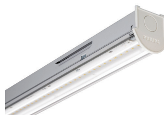
Standalone (clear option shown)

The Philips GreenPerform LED Batten is a high quality LED batten that's at home in a variety of applications, from warehouses to corridors and storage spaces. The high system efficacy delivers significant energy savings of up to 50% as compared to conventional T8 battens. The reliable and robust housing structure maximises the durability and contributes to the GreenPerform's long lifetime. With its flexible optics and mounting accessories, the GreenPerform LED Batten is suitable for symmetrical, asymmetrical, direct and indirect lighting applications.